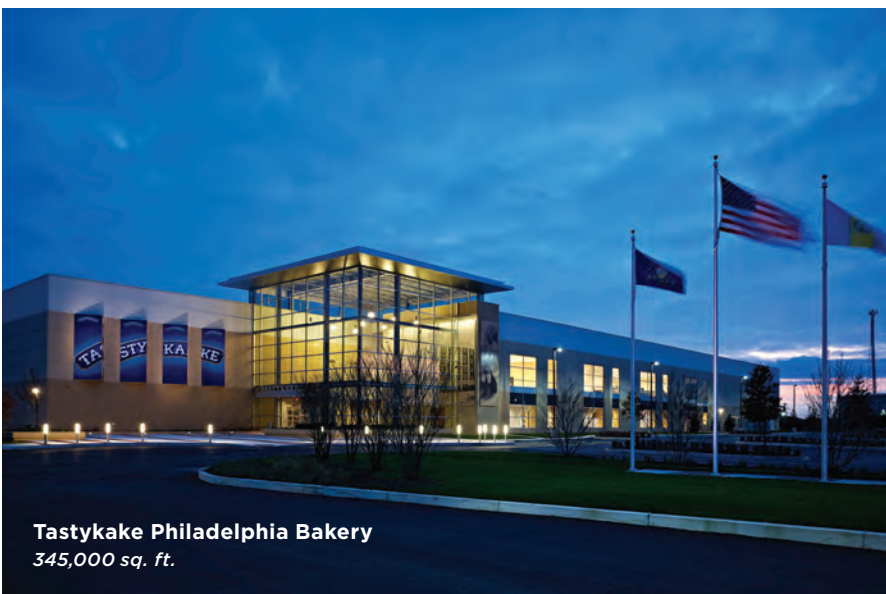
Tastykake Philadelphia Bakery 345,000 sq. ft.