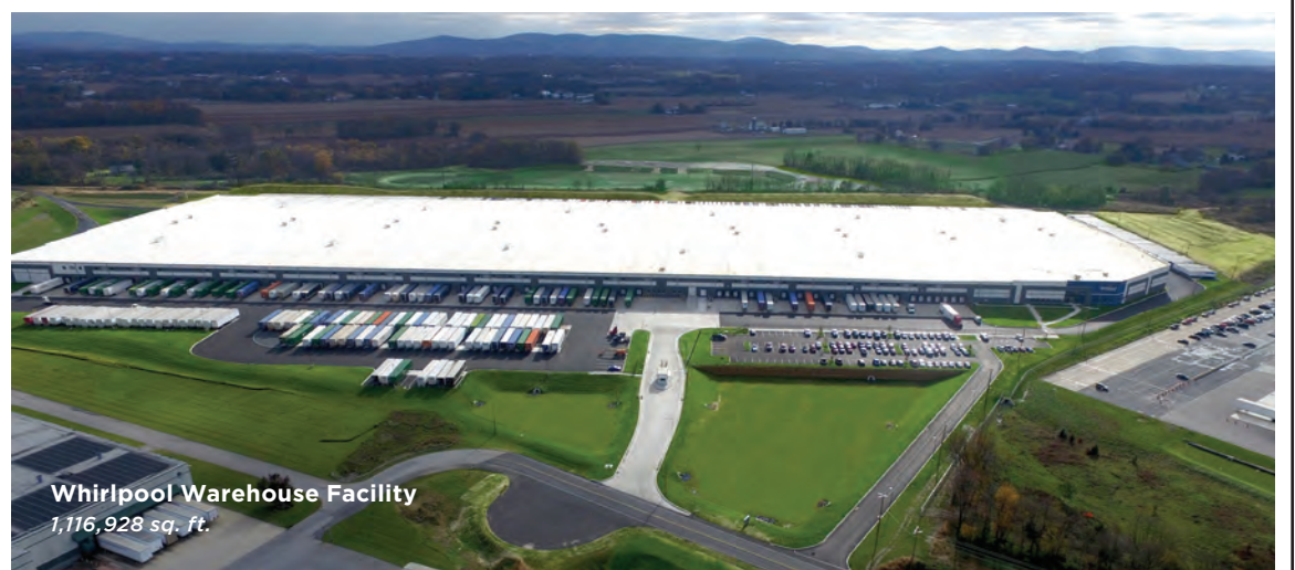
Whirlpool Warehouse Facility 1,116,928 sq. ft.