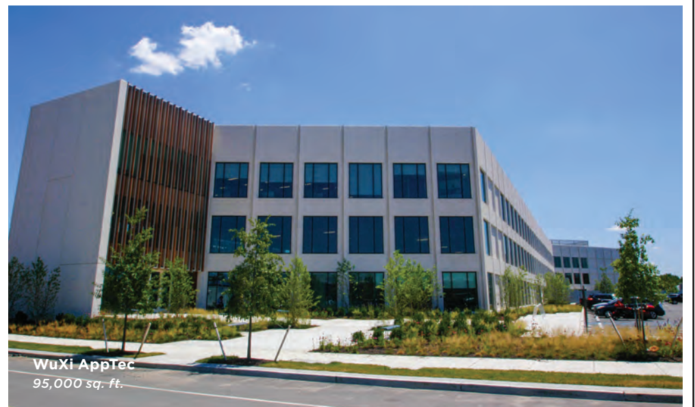
WuXi AppTec 95,000 sq. ft.

Design-Build ▪ Preconstruction ▪ Construction Management ▪ General Construction ▪ Renovations & Interiors