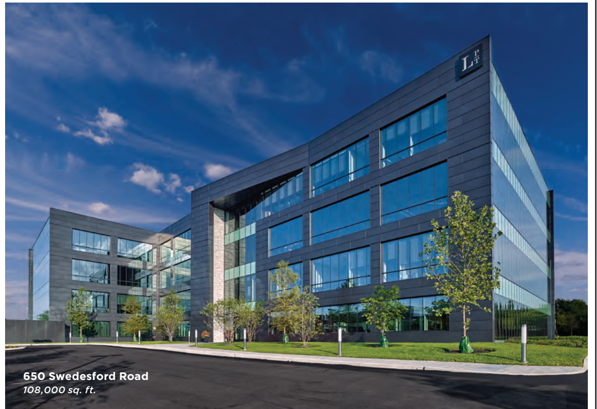
650 Swedesford Road 108,000 sq. ft.

From building at the heart of innovation with multiple sites inside Philadelphia’s iconic Navy Yard to managing projects for major commercial and industrial brands who call the region home, Penntex is proud to work with partners across the greater Philadelphia area to continue to support ongoing growth and development.